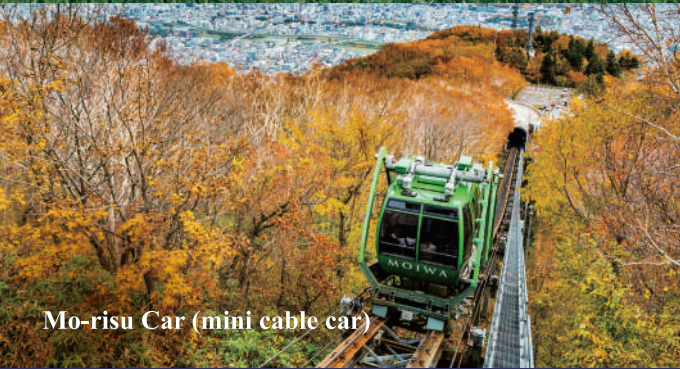
Mo-risu Car (mini cable car)