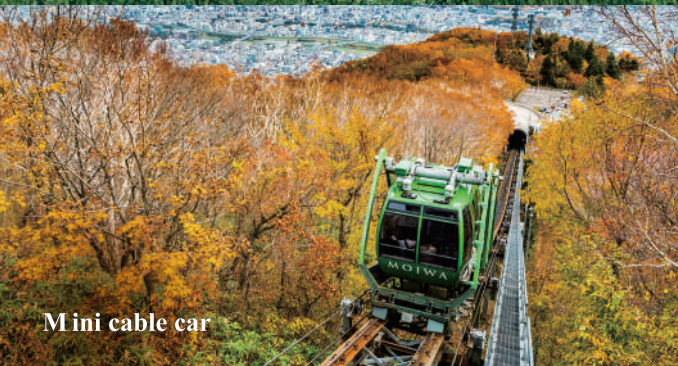
Mini cable car