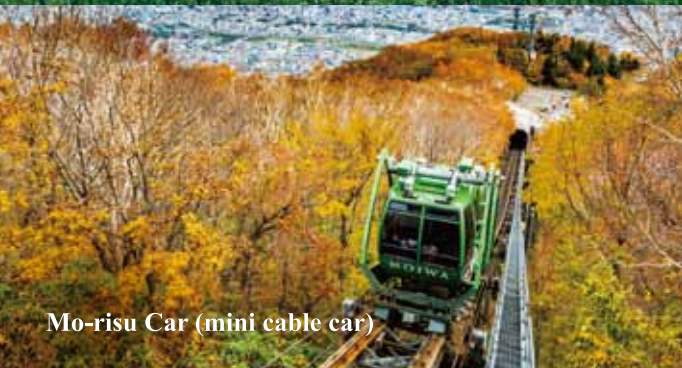
Mo-risu Car (mini cable car)